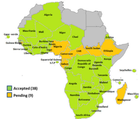
Figure 3: Country polio-free status documentation accepted by ARCC, May 2017.

international experts' evaluation teams in 2014-2015 and the processes for preparing documentation have commenced with technical support by the WHO African Region.