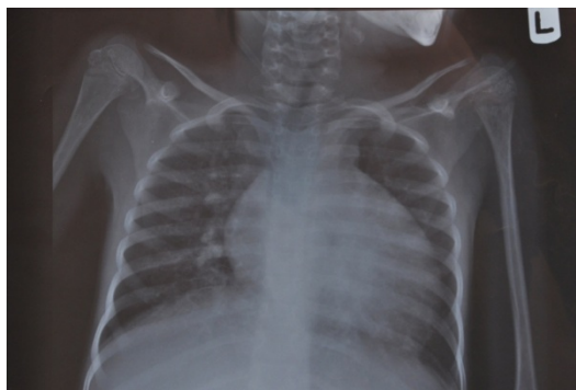
Figure 1: CXR-Cardiomegaly with a CTR of 80% Oligemic field.

OO, is a 9 year old girl who presented with progressive easy fatigability, fast breathing and intermittent cough since early infancy. She was being managed for Patent ductus arteriosus, but defaulted for 4 years. At representation, in addition to the above, she developed bluish discoloration of the lips and mucosa (Figures 1 and 2) [1-3].